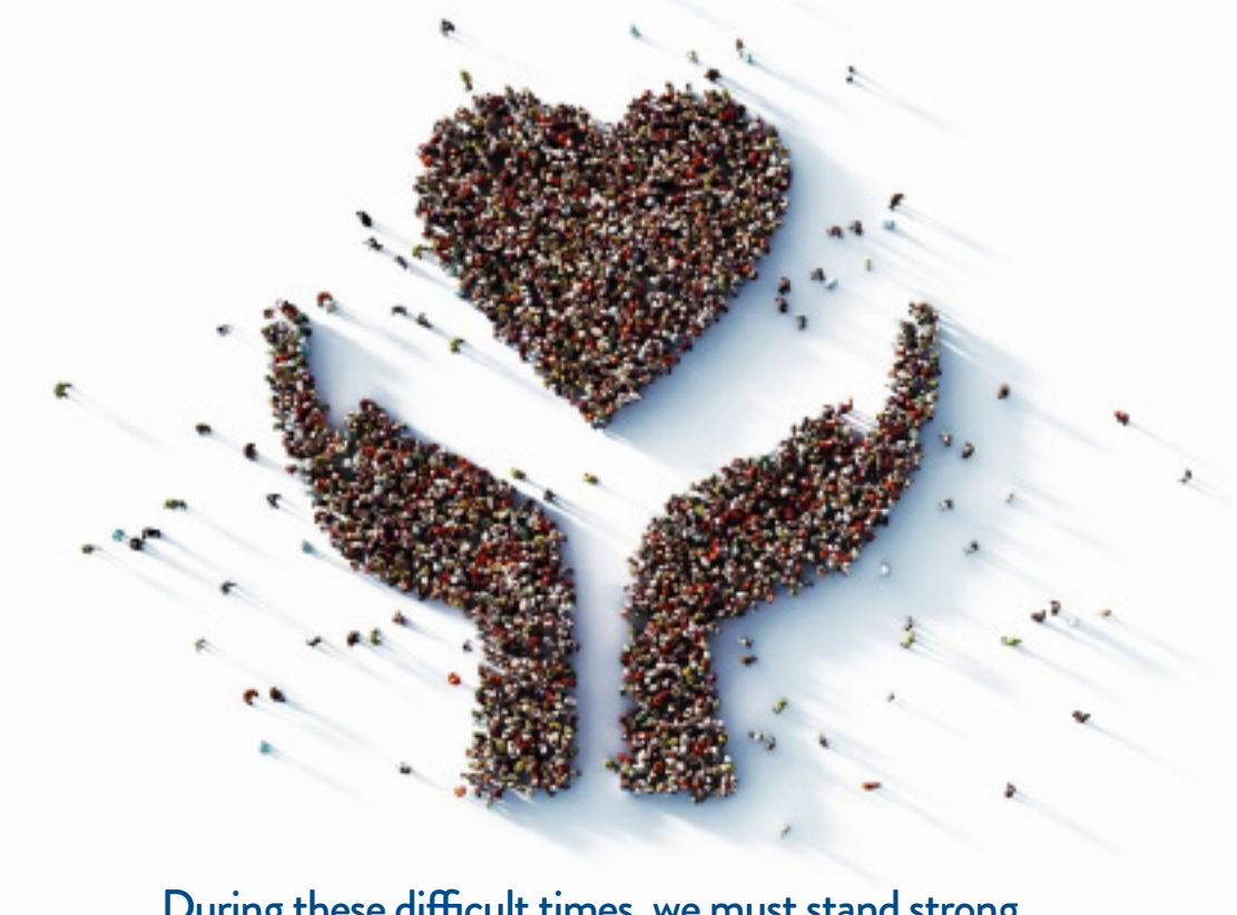
During these difficult times, we must stand strong together as one people, one voice.

The Jewish Center of the Hamptons exists because of you – our members.